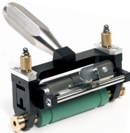
Esiproof Spring version