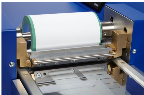
Below: Detail of the GP100 in use

High quality proofs using gravure inks of press viscosity are produced instantly using the new GP100. Featuring a microprocessor controlled servo drive and pneumatic operation, electronically engraved printing plates and variable printing speeds of 1 to 100m/min, this is an essential tool for all those involved in the manufacturing or use of liquid inks. Ideal for R&D and computer colour matching data, quality control and presentation samples, the GP100 is very easy to clean.