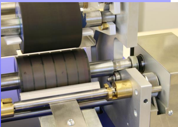
Below: Detail of the Paste Ink Proofer Roller Head

The RK instrument for quick, repeatable and highly accurate proofing and colour-matching of all types of litho, web-offset, letterpress inks and varnishes. The Paste Ink Proofer is unique in featuring automated operation, eliminating the need to weigh or measure ink samples.