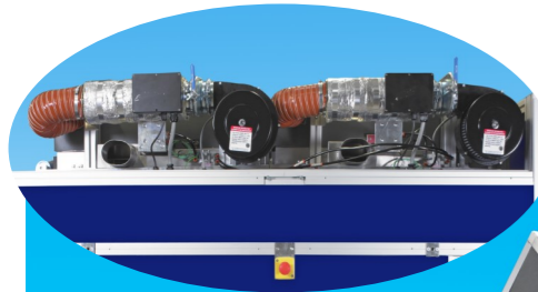
Integrated heating and extract system