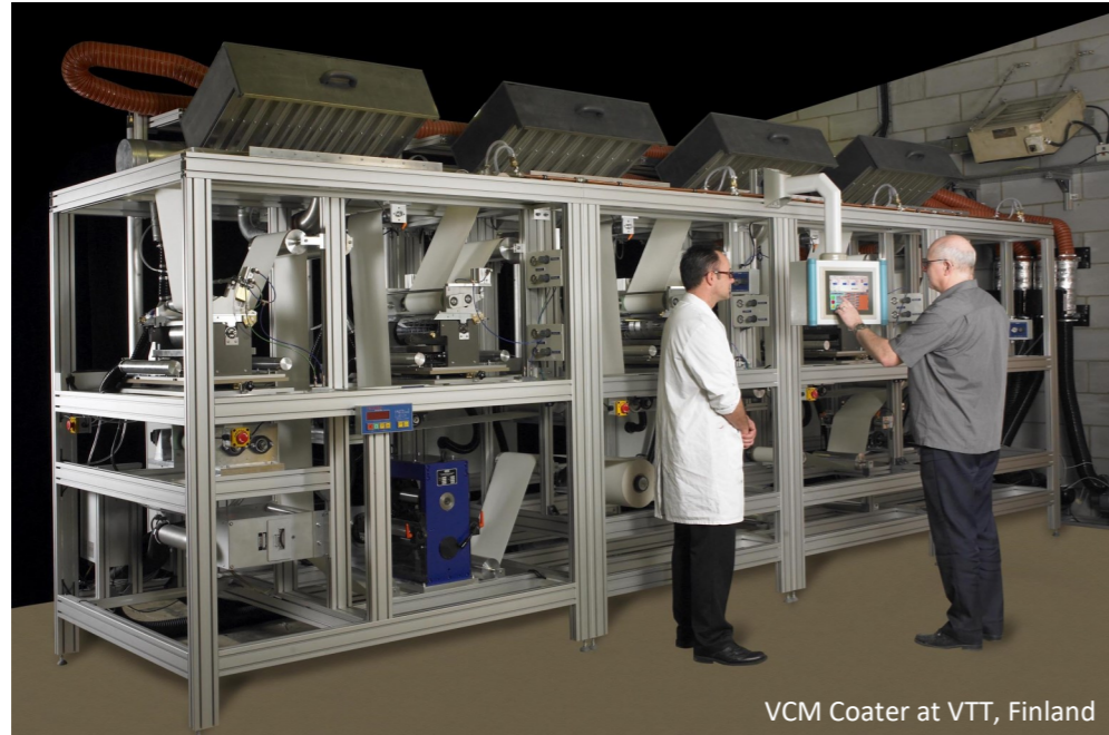
VCM Coater at VTT, Finland