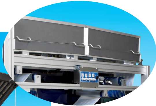
Pneumatically operated ovens