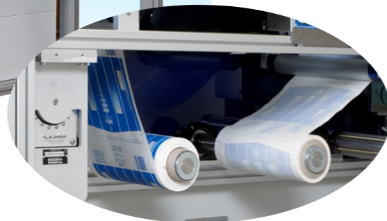
Unwind and rewind 76mm core