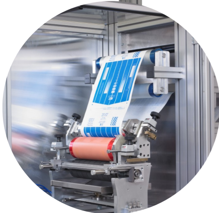
Coating Station in optional ATEX Zone